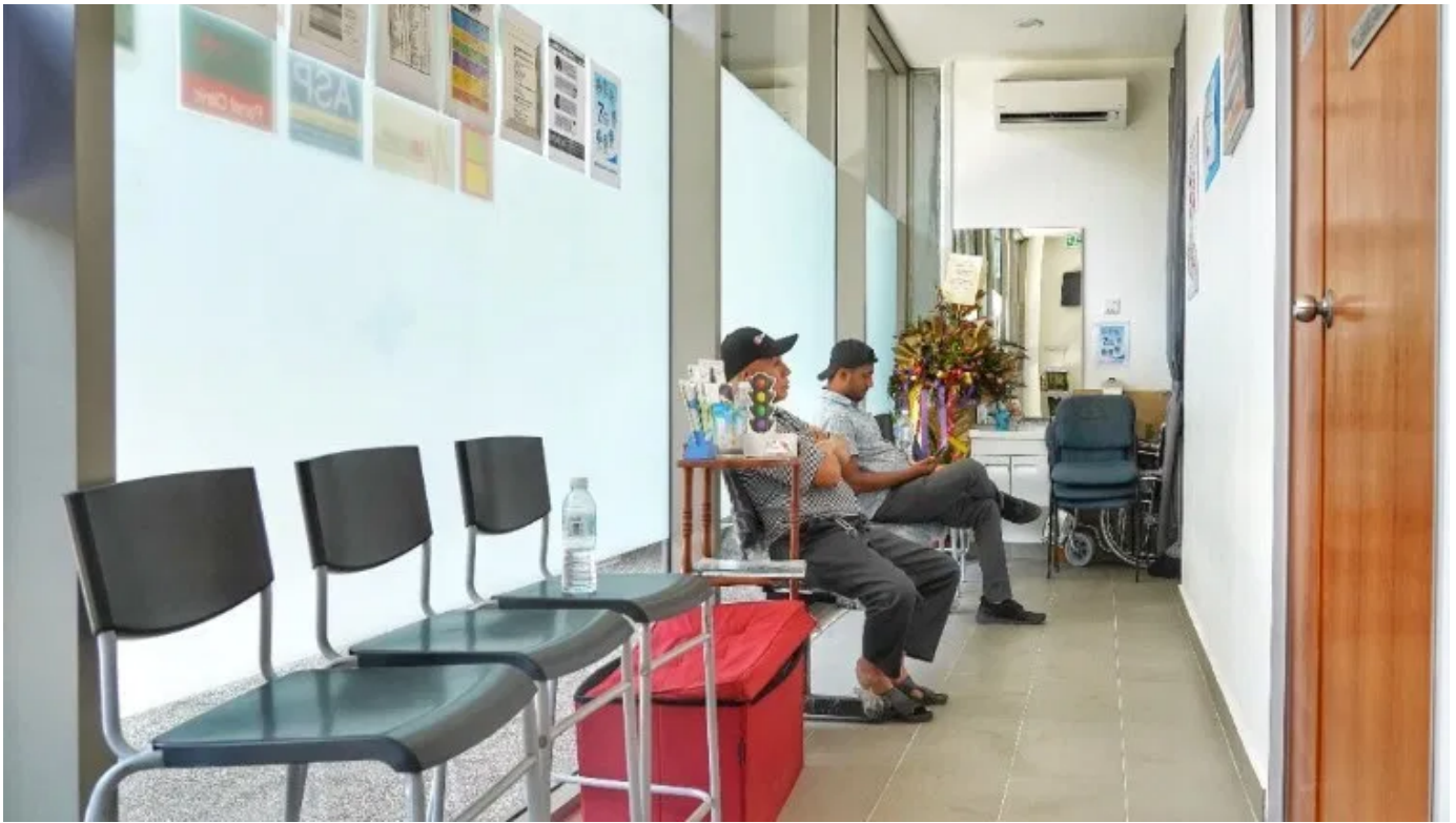
Patients wait at a GP clinic in Kuala Lumpur.

KUALA LUMPUR, Feb 18 — Medical groups said private hospitals and clinics are ready to provide their services to the national Covid-19 vaccination programme, Malaysia's biggest inoculation campaign in history.